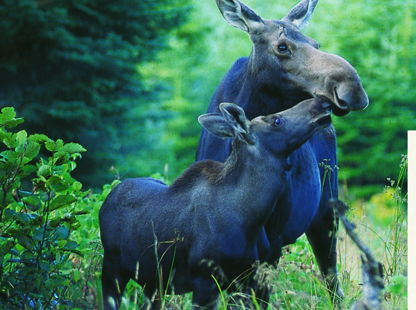
Moose are often seen at roadsides in low-lying swampy areas.

North of the Notches, New Hampshire's mountainous topography wanes and the true wilderness begins. Moose, deer and other wildlife are abundant in the Great North Woods Region, and the area offers many opportunities for hiking, camping and wildlife viewing.